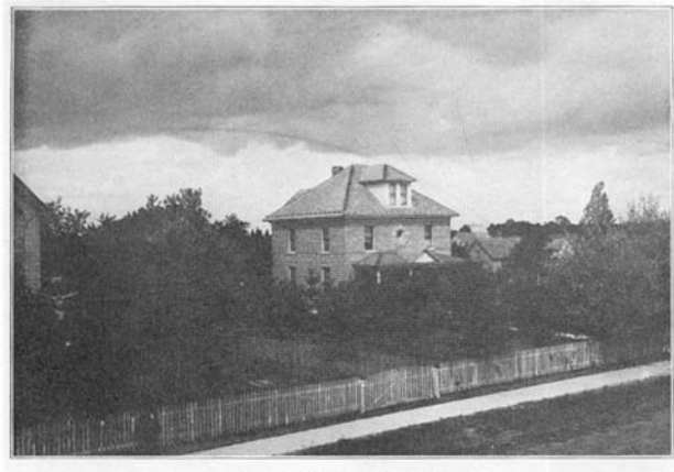
Fara v Silver Lake, Minn.

Historical photo of the St. Joseph Church and Rectory, circa 1910.