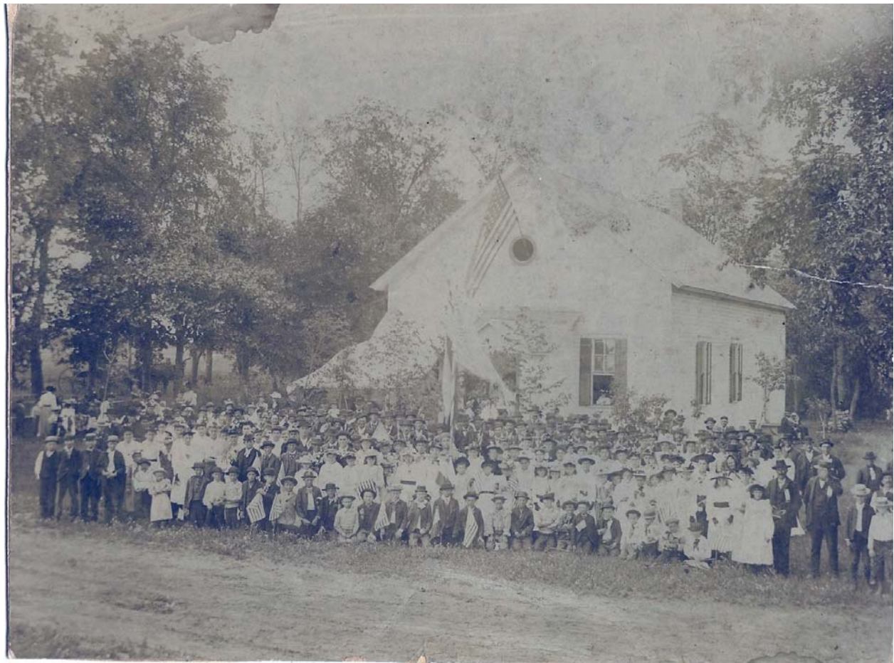
Bohemian Reading and Educational Society picnic, held at the Bohemian Hall, on the Northwest corner of the intersection of what is now State Highway 7 and Major Avenue, sometime between 1884 and 1895.